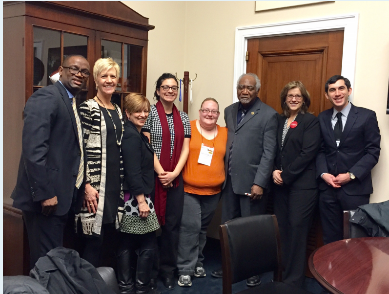
Gladly discussed on school summer meals with Greater Chicago Food Depository