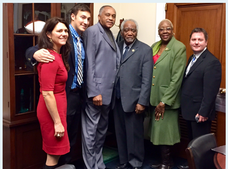
I agreed with Tommie Smith, our 1968 Olympic Gold Medalist and the group of Sports and Fitness Industry Association that Physical Education is important to increase the quality of life of our children